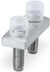
Fixed bridge, pitch: 20 mm, number of positions: 2, color: silver

Please be informed that the data shown in this PDF Document is generated from our Online Catalog. Please find the complete data in the user's documentation. Our General Terms of Use for Downloads are valid ( http://phoenixcontact.com/download )